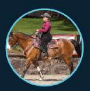
501 (C) (3)